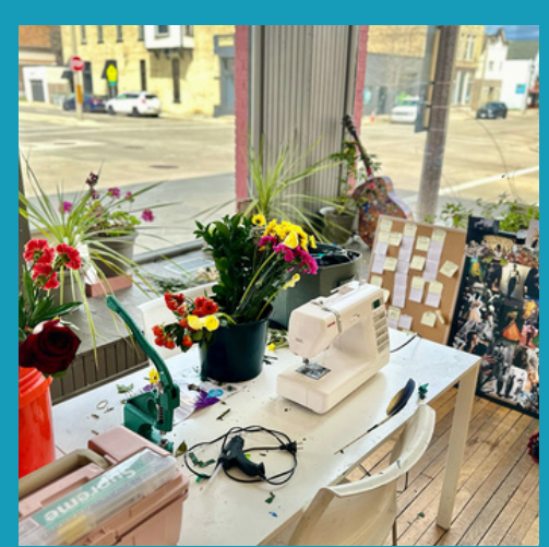
Nohemí Chávez Contreras, 2025